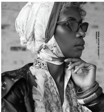
Edith Bouvier Beale -Grey Gardens